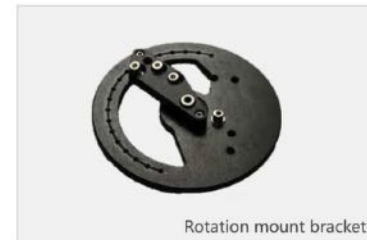
Rotation mount bracket