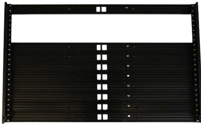
▲ Fence mount bracket